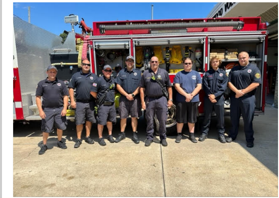
The Linwood Fire Department is the best next-door neighbor possible. Sitting next to the former Leedsville School and current Linwood Historical Museum, the firefighters lend a hand as well as join the celebration.