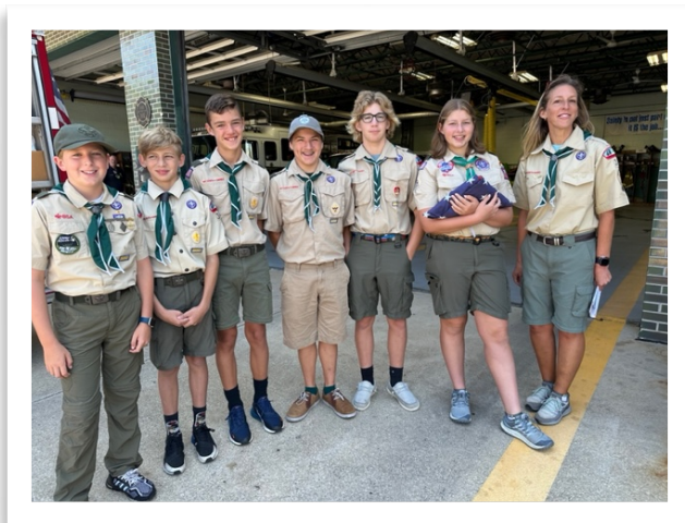
Linwood Scout Troop 39 before the flag raising ceremony that started off the day.